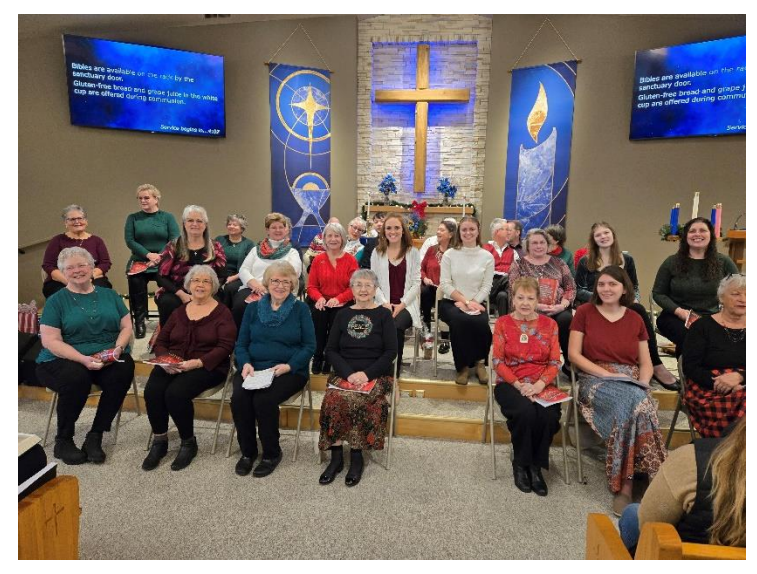
Everlasting Light: The Promise of Christmas