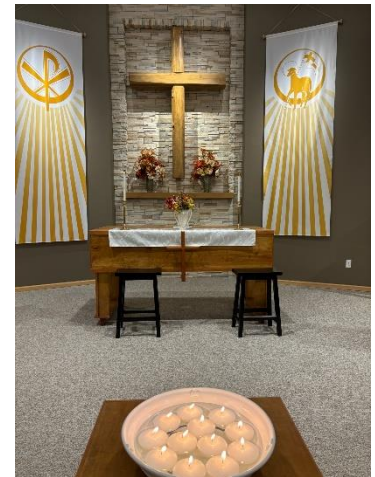
Remembering the Saints

Need another Time & Talent sheet? Extras can always be found on the wall rack in the fellowship hall!