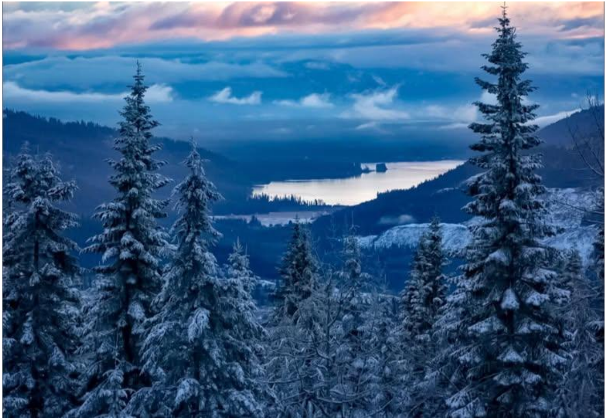
Spirit Lake from Mt Spokane

Please register for all events at https://www.lutherhaven.com/